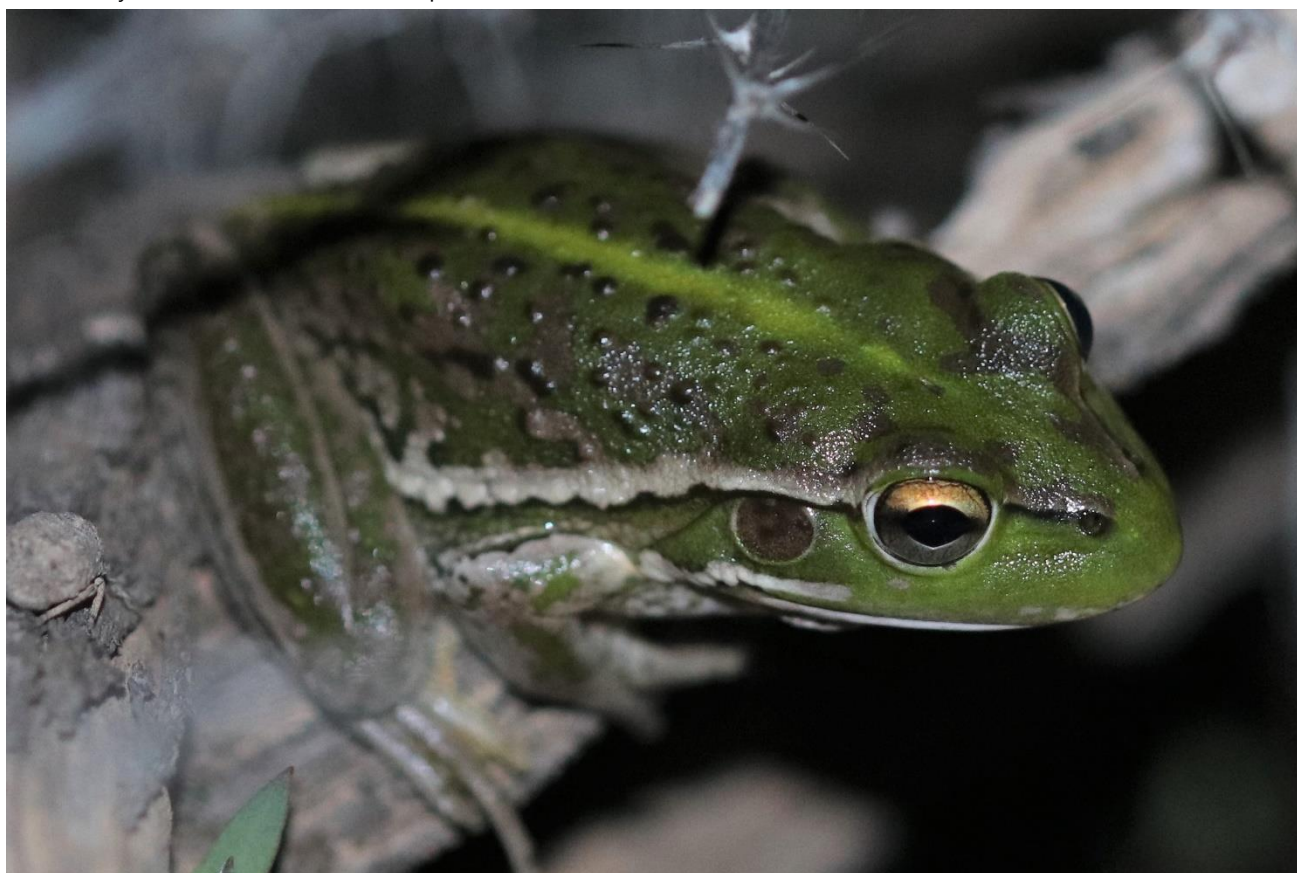
Figure 2: A nationally vulnerable Southern Bell Frog spotted on the Pike Floodplain