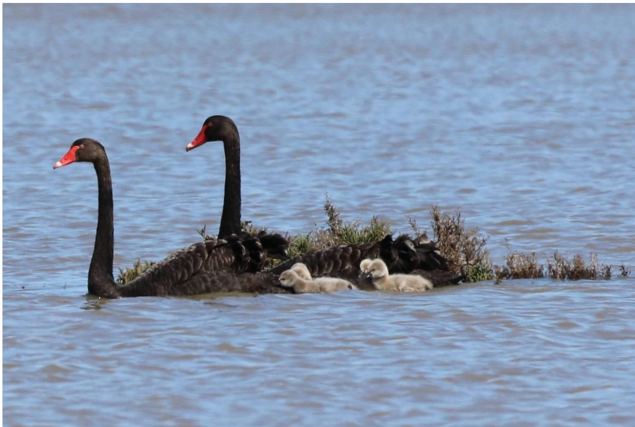
Figure 4: Black swans and their cygnets on the Pike floodplain (Samantha Walters, DEW)