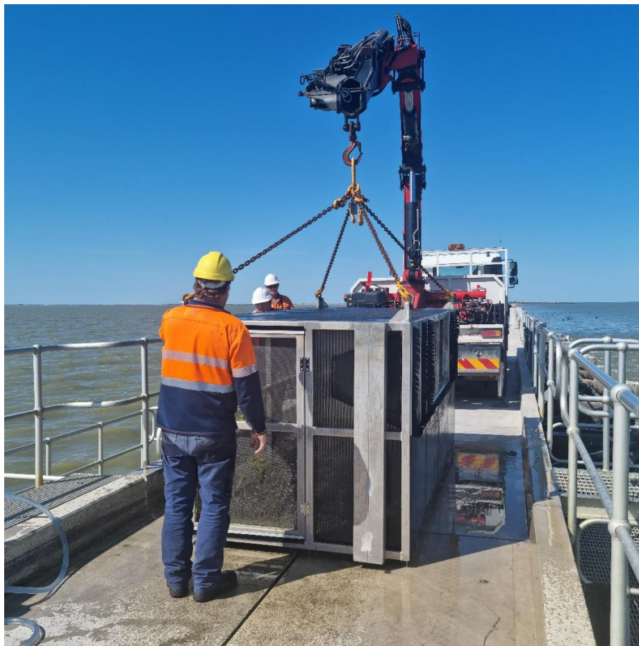
Figure 3: SARDI Aquatic Scientists and SA Water pulling a fishtrap from a barrage fishway to monitor lamprey as they migrate

https://www.environment.sa.gov.au/topics/river-murray/improving-river-health/environmental-water/where-is-larry-the-lamprey .